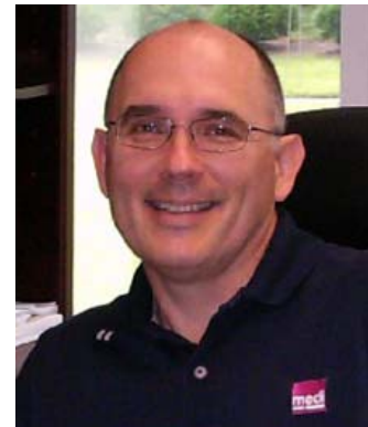
Ed Wilbourne Medi USA INTRODUCING The Spinomed IV Spinal Orthosis for Osteoporosis

FASCIA & POSTURE We're Not As Stuck As We May Think